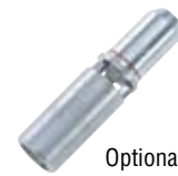
Optional Nozzle Tip S-116